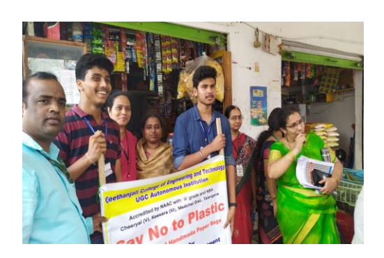
Awareness program on usage of plastic in Cheeryal